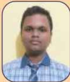
SAKSHYAM SUJAY X TOPPER 2024